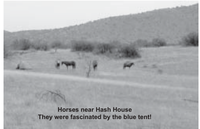
Horses near Hash House They were fascinated by the blue tent!