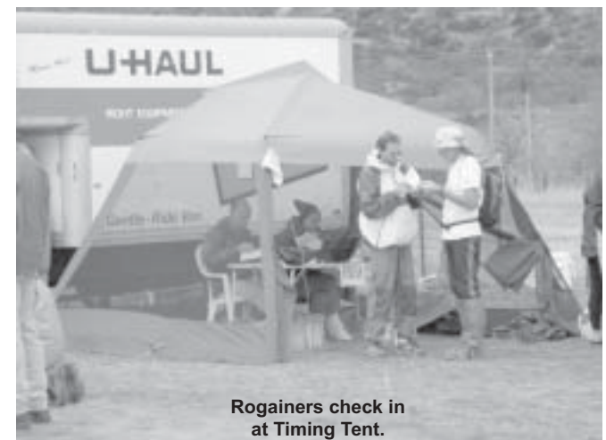
Rogainers check in at Timing Tent.