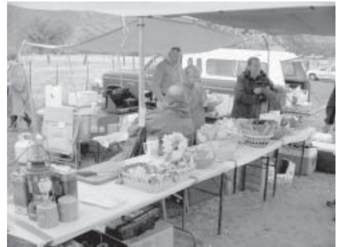
The Hash House Sunday morning before the rains.